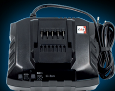
CHARGER 12-36 V