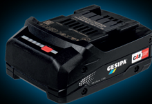
18V / 2.0 Ah

The CAS battery packs provide exceptional service life and power. Depending on the design, they are based on Li-Ion or LiHD technology. GESIPA® blind riveting and blind rivet nut setting tools can be purchased as standard with 2.0 Ah battery packs – the compact 4.0 Ah battery is also available as an accessory. But of course all other available CAS battery packs can also be used with our Bird Pro tools.